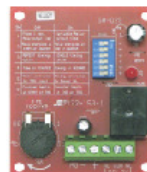
SA-025Q Multi-Purpose Programmable Timers