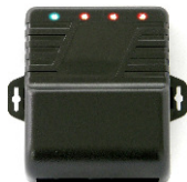
SA-025EQ Delay Egress Timer